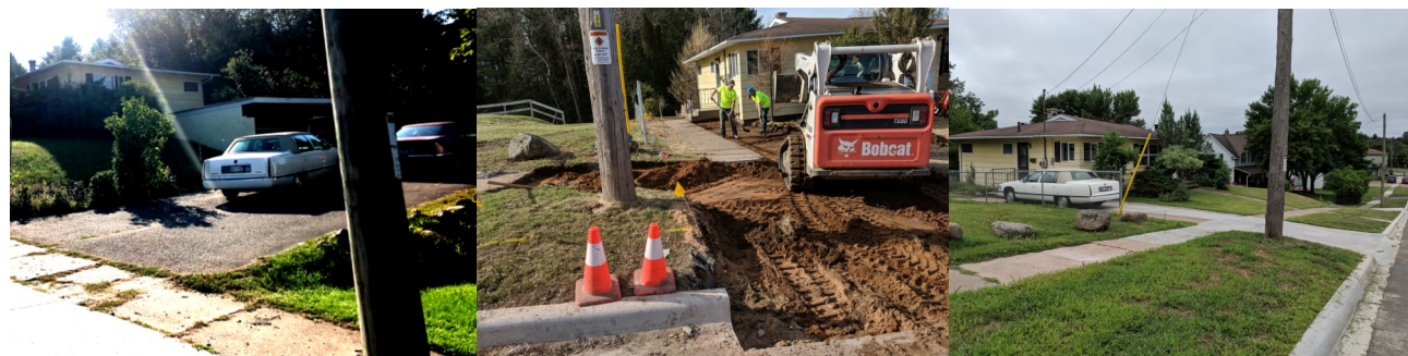
Before, parking only at lower level