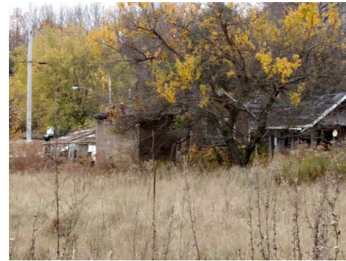
139 W Lincoln, Iron Mountain

Future repair projects include several ramps, roofs, and window replacements. Information on how to apply for the repair program is also on the website or please contact the office.